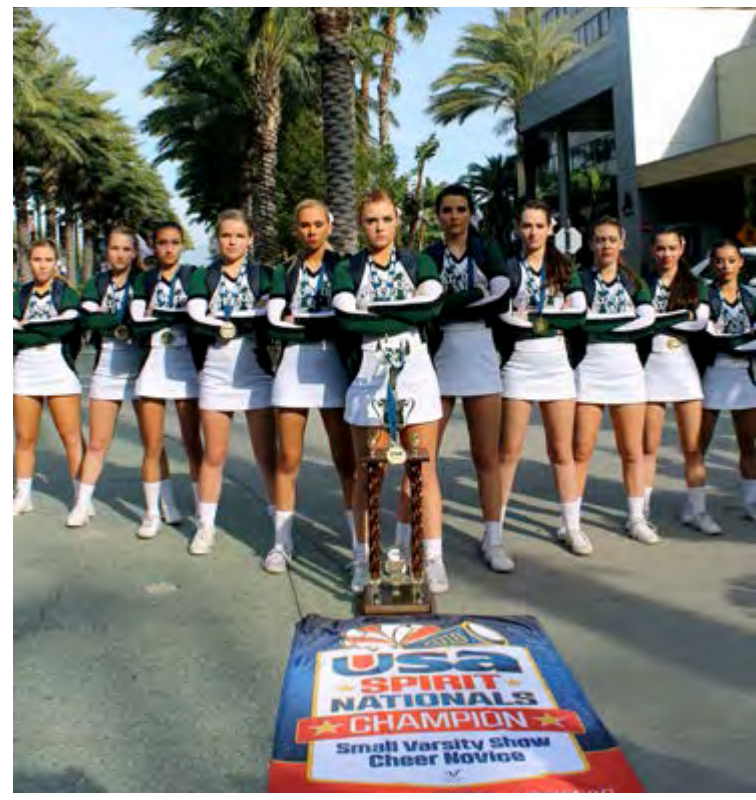
The Miramonte Competitive Cheer team is serious about their sport, winning the national championship in the Varsity Small Show Cheer Division.

School's National Champion Competitive Cheer Team is a bit like climbing the human pyramids because she's been dropped. "It's its members build.